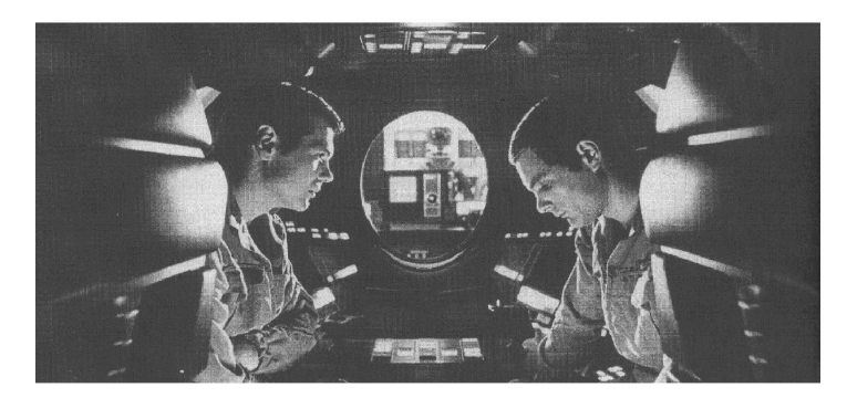
Fig. 16.6. In Arthur C. Clarke's 2001: A Space Odyssey, human beings are compelled to hide from the psychotic computer HAL