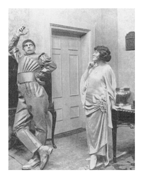
Fig. 16.1. Scene from Capek's play Rossum Universal Robots