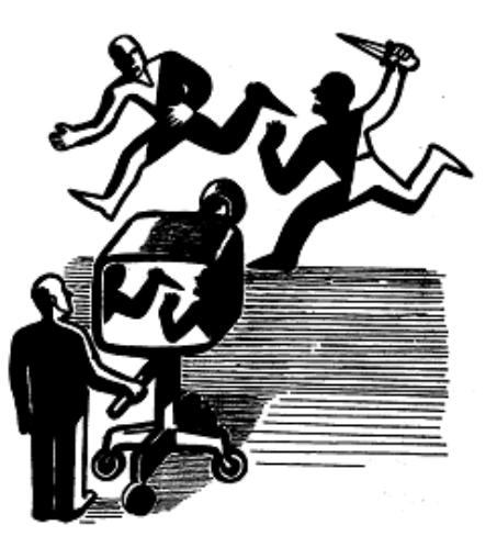
Fig. 16.4. Select-O-Vision