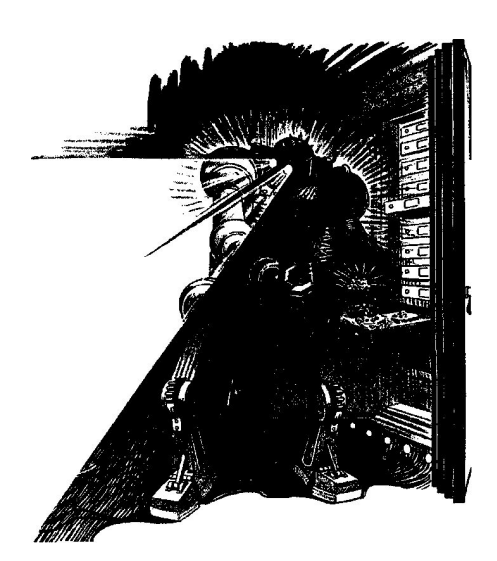
Fig. 16.5. A robot thief