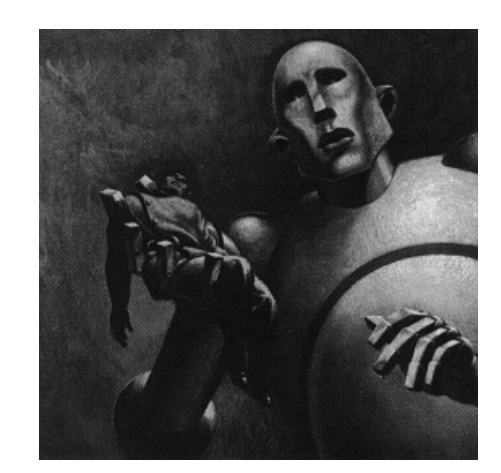
Fig. 16.3. Powerless in the grasp of a robot (From Astounding Science Fiction, October 1953)